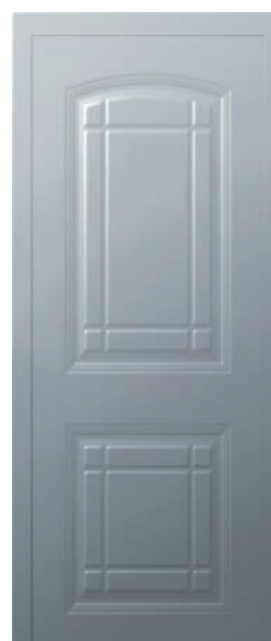
(AL59 ex AL10)