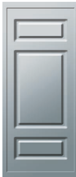
(AL24 ex AL06)