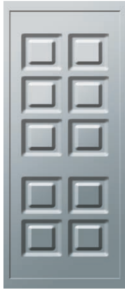
(AL21 ex AL02)