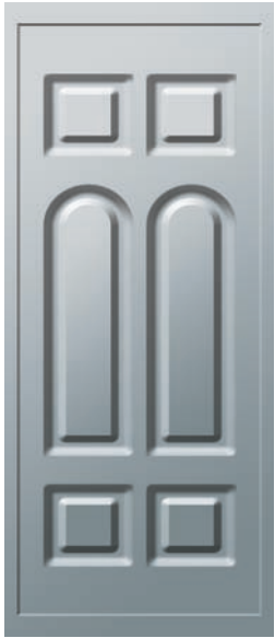
(AL20 ex AL04)