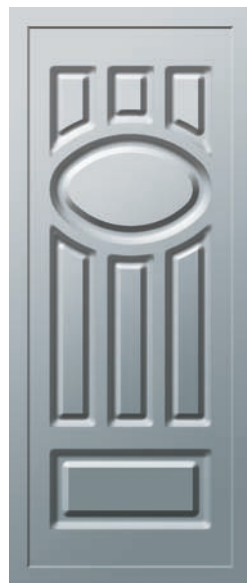
(AL38 ex AL07)