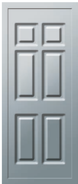
(AL52 ex AL01)