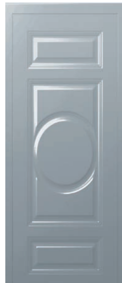
(AL25 ex AL05)