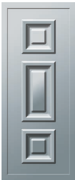
(AL53 - AL08(6))